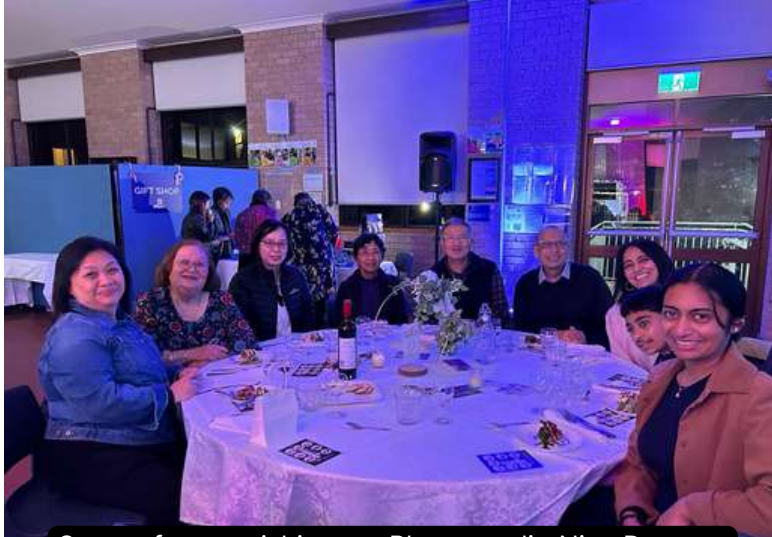
Some of our parishioners.